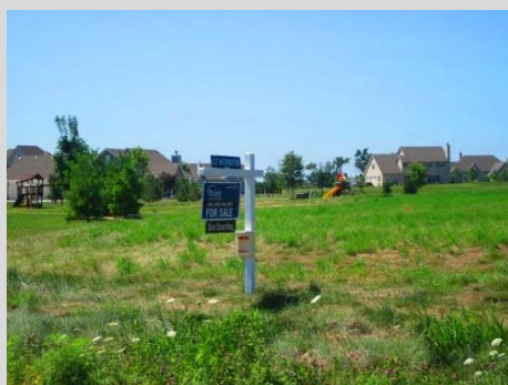
A great location to raise your family or spend your Golden Years