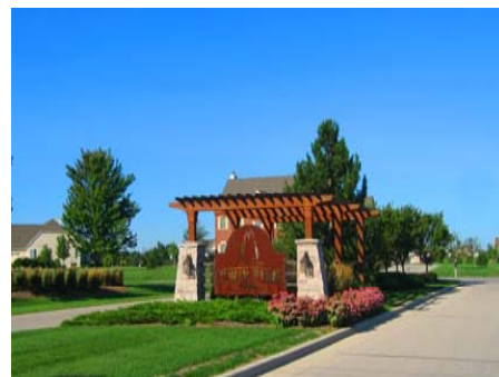
Welcoming main entrance

A great location to raise your family or spend your Golden Years